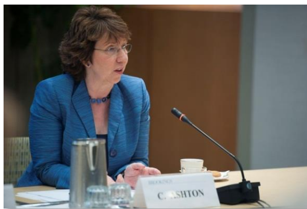
Catherine Ashton, High Representative of the Union for Foreign Affairs and Security Policy 109

The EU is also concerned about the disappearance, in China , of a large number of Tibetans, from 2008, and hundreds of young Uyghur men, after the unrest in Xinjiang in 2009. The EU has raised its concerns with the Chinese authorities in the EU- China human rights dialogues and has urged China to co- operate fully with the UN Working Group on Enforced Disappearances. In her statement of 12 April 2011, 107 the message of the High Representative of the Union for Foreign Affairs and Security Policy, Catherine Ashton, was very clear: “ Arbitrary arrests and disappearances must cease. I urge the Chinese authorities to clarify the whereabouts of all persons who have disappeared recently. I call on China to ensure that the treatment of the individuals in question is fully in accordance with international human rights standards and the rule of law ”. 108