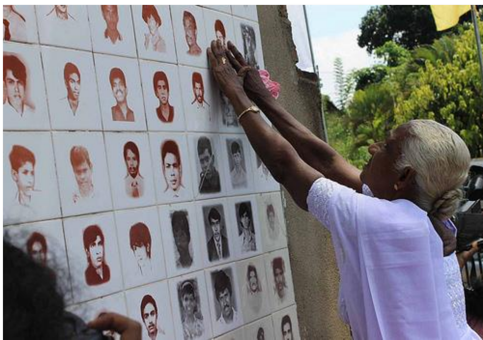
Family member of a disappeared person, Sri Lanka 89

In Sri Lanka , around 12,000 complaints of enforced disappearances have been submitted to the UN since the 1980s. Although the majority of cases date back to Sri Lanka's civil war between the government and the 'Tamil Tigers', which ended in 2009, enforced disappearances in the country continue to be reported. 88