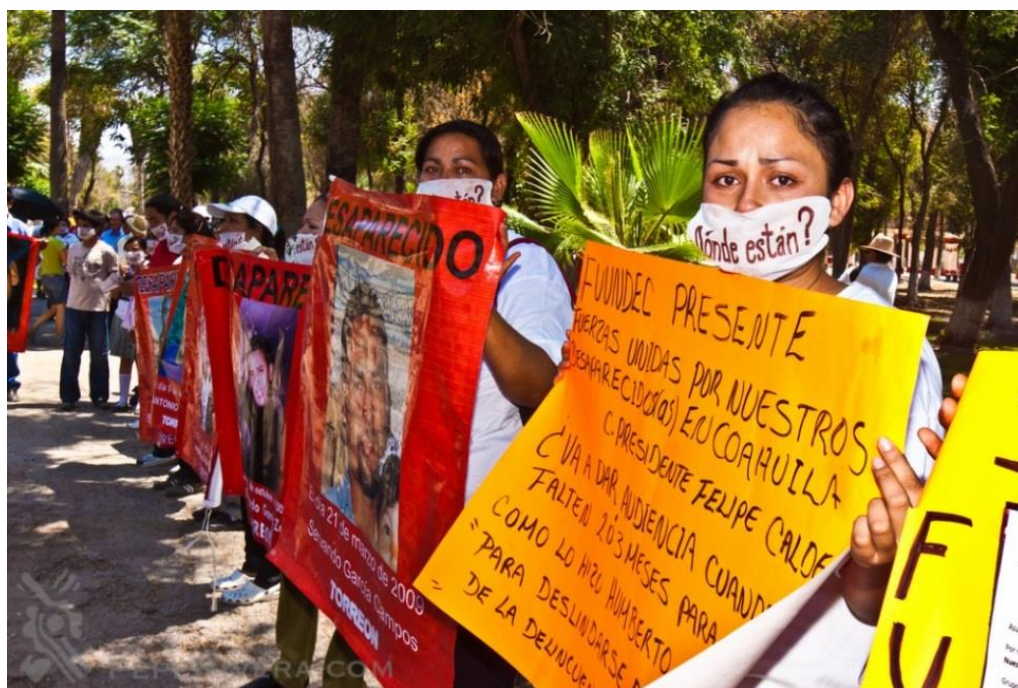
Women demanding a hearing with former President Felipe Calderon, State of Coahuila, Mexico 28

mothers and grandmothers). Every minute that is spent looking for the disappeared person is not being spent on looking for means of income. People in this precarious situation are often discouraged from investigating the case, not only out of fear but for economic reasons. They can furthermore be exposed to sexual harassment or abuse while searching for their loved one. 27 As stated before, female relatives are left in a legal limbo due to the nature of the crime that targeted their male relative. They are unable to inherit, to receive their husband's pension or to remarry, in the absence of a death certificate.