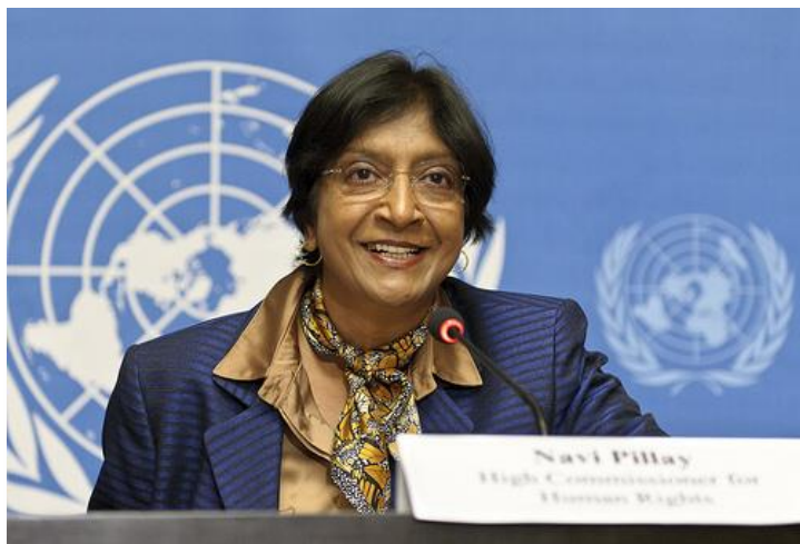
Navi Pillay, United Nations High Commissioner for Human Rights 90

In addition to the important activities of the Working Group on Enforced and Involuntary Disappearances and the Committee on Enforced disappearances presented above 91 , the United Nations addresses the practice of enforced disappearance through the Office of the High Commissioner for Human Rights (OHCHR) .